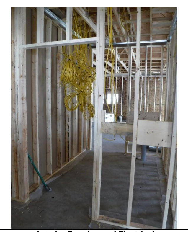
Interior Framing and Electrical