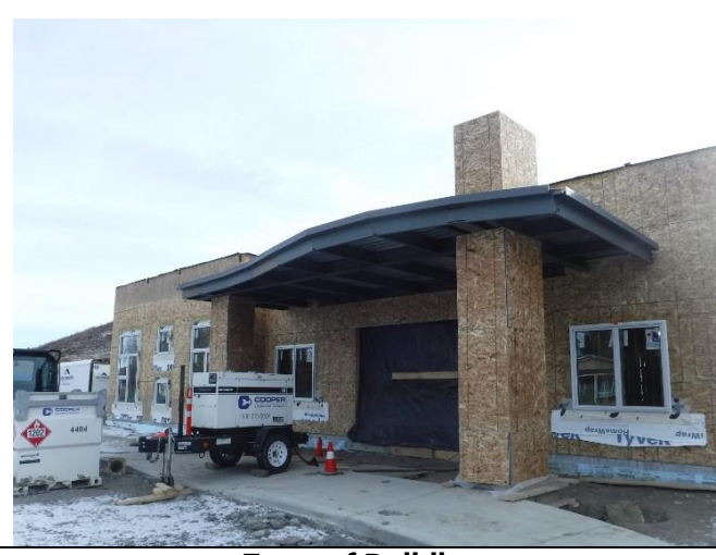
East Facing Exterior Siding