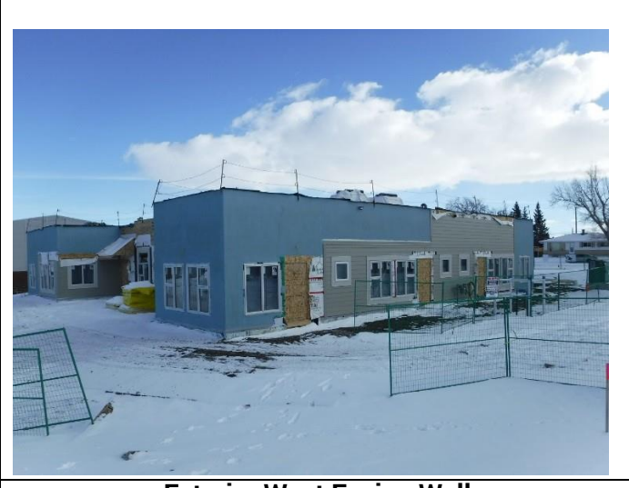
Exterior West Facing Wall