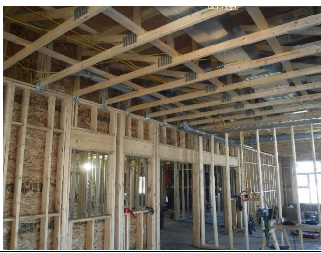
Roof Drain and HVAC Rough-In