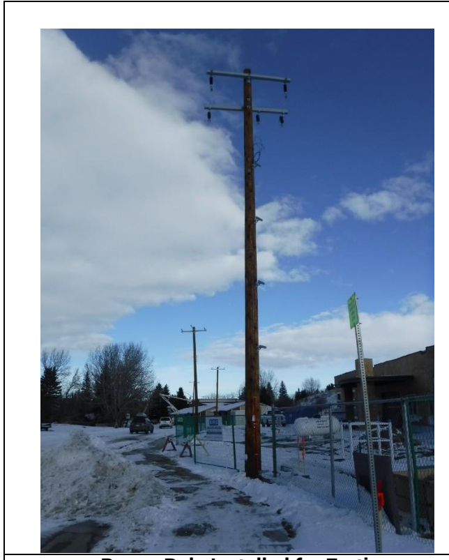
Power Pole Installed for Fortis