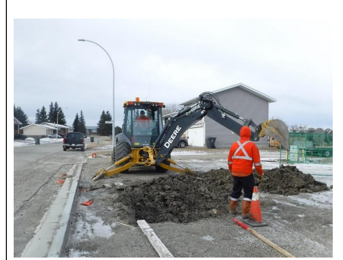
Underground Power Installation